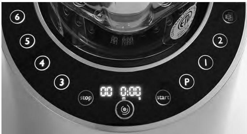
The colour of base may vary