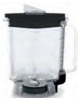
Jar with lid