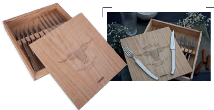
BOX CUBERTERÍA 12 Pieces|Piezas

Ref.: PCP-1100-12M Code: 5607863058008 🔒 Gr: 1772 ↔ M.: 263x260x46mm