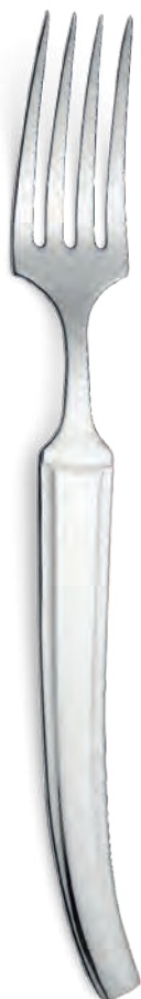
STEAK FORK TENEDOR DE CARNE AISI 304 | 4,0 mm

Ref.: PP-1116 Code: 5607863035269 Gr: 65 ↔ M.: 209 mm