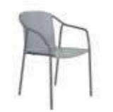
MN-ROD01 anthracite 029X00 blue grey