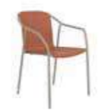
MN-ROD03 taupe 026X00 terracota