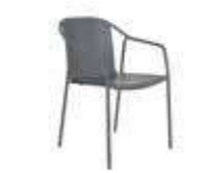
MN-ROD01 anthracite 091X00 anthracite