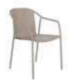
MN-ROD03 taupe 024X00 taupe