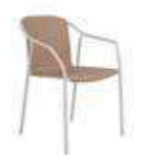
MN-ROD04 sand 027X00 capuccino

Sillón apilable. Estructura de aluminio lacado. Asiento de polipropileno. Tacos antideslizantes. Cadeira empilhável. Estrutura em alumínio lacado. Assento em polipropileno. Tacos antiderrapantes. Stackable armchair. Laquered aluminium frame. Polypropylene shell. Non slip caps. Fauteuil empilable. Chaise en aluminium laqué. Assise en polypropylène. Embouts antidérapants.