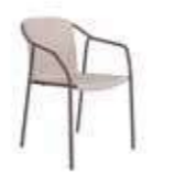
MN-ROD02 moka 028X00 pearl