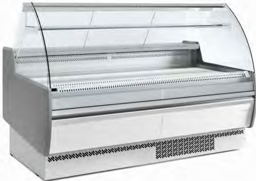
VMC 18 R