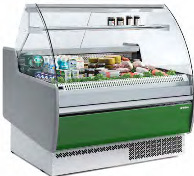
VMC 12 R

Fotos no contractuales / Non contractual pictures