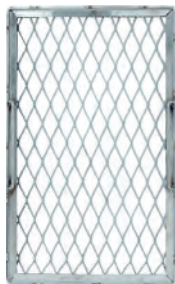
Z-RII / Z-RIIE9

Rejilla inferior soporte carbón/ Especial para PB-PBI y PBV-90 Bottom rack coal support/ Special for PB-PBI and PBV-90