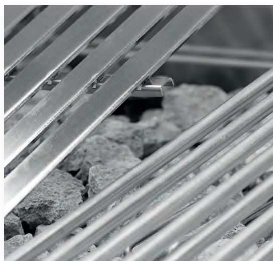
Rejilla acanalada/rejilla de varilla Ribbed rack/rod rack