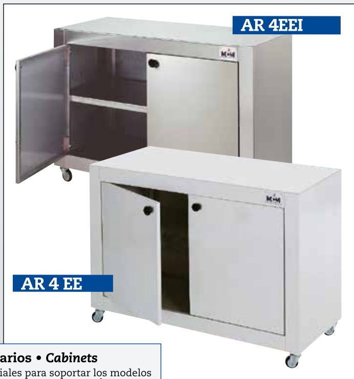
AR 4 EE