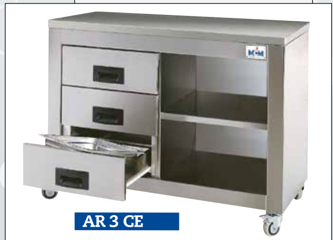
AR 3 CE

Cabinet with drawers and shelves. Manufactured entirely of stainless steel. Gastro trays 2/3. Telescoping drawers. Wheels equipped with brakes.