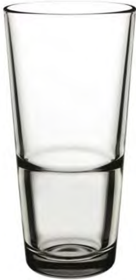
REF: TK010201 GRANDE 43'5 CL R/52080 VASO Volume: 480 cc. Height: 160 mm. Top Diameter: 86 mm. Bottom Diameter: 61 mm. U/C: 12