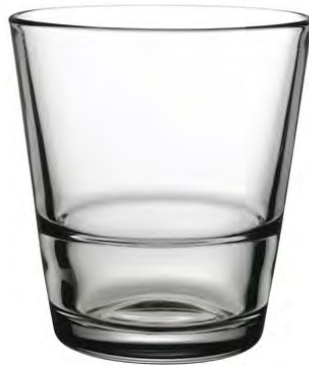
REF: TK010200 GRANDE 41'0 CL R/52070 VASO Volume: 410 cc. Height: 105 mm. Top Diameter: 98 mm. Bottom Diameter: 67,5 mm. U/C: 12