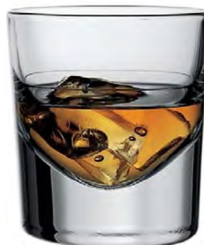
REF: TK010077 VASO GRANDE 135 CC. WHISKY ( 52783 ) 135 cc. h.80 mm. t. 72 mm Ø61 mm. Cod.5.10970 U/C: 6