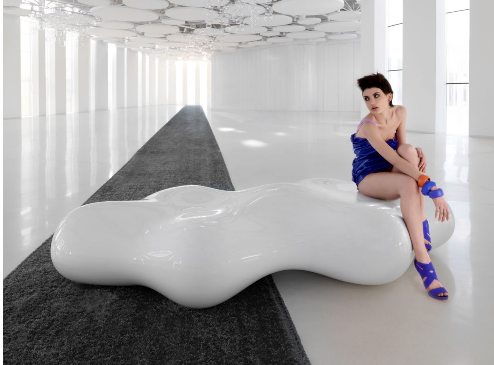
LAVA BENCH lacquered white